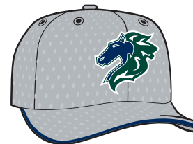
BATTING PRACTICE CAP