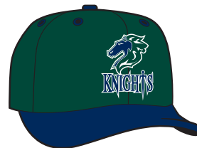
ALTERNATE CAP 1